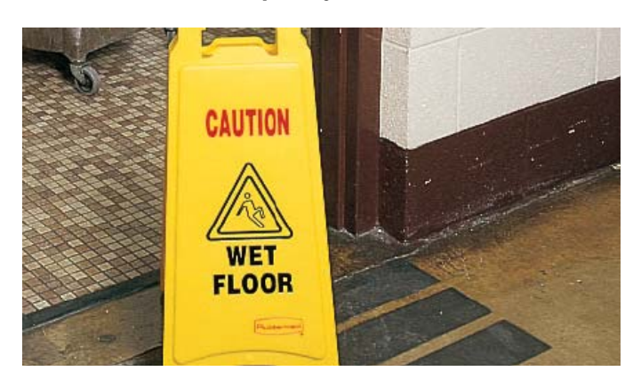
STEP 7: Warn of Temporary Hazards

While workplace signs and labels are a more permanent solution to identify slip hazards, sometimes you need a more temporary option. When there's a short-term hazard due to maintenance, housekeeping or a spill, it can be marked with cautionary floor stands, barricade tape, and warning posts and chains. That way you can easily put these signs into place when needed, and remove them when the area no longer poses a threat.