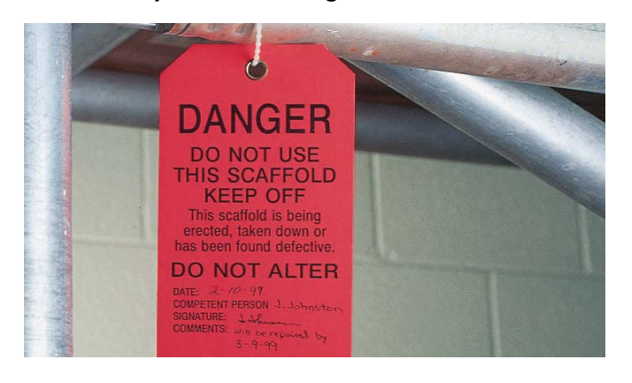
STEP 8: Inspect Scaffolding and Ladders

While workplace signs and labels are a more permanent solution to identify slip hazards, sometimes you need a more temporary option. When there's a short-term hazard due to maintenance, housekeeping or a spill, it can be marked with cautionary floor stands, barricade tape, and warning posts and chains. That way you can easily put these signs into place when needed, and remove them when the area no longer poses a threat.