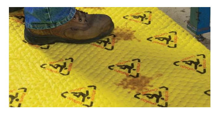
STEP 9: Control and Clean Oil and Spills

While keeping your floors clean and dry is an essential step in preventing slips, there's no denying that leaks, drips and spills are common occurrences in a workplace. When faced with oversprays that coat surfaces with oily film, slow drips from machinery or a spilled cleaning chemical, you need a process for immediately detecting, assessing and correcting all types of spills.