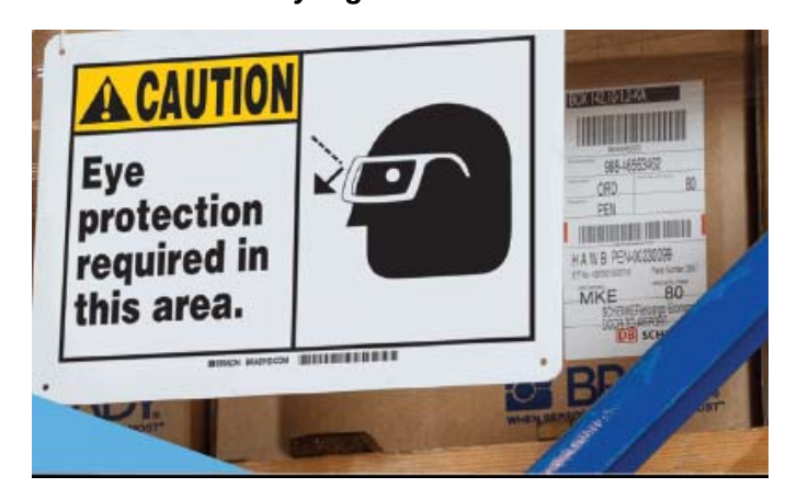
STEP 6: Post Safety Signs and Labels

The first line of defense in protecting workers against slips, trips and falls is putting the right signs in the right places. With warning signs at the point of need, you can tell workers at-a-glance of any nearby hazards, including equipment leaks, uneven surfaces and other potential obstacles. Effective signage includes a clear header, bright colors, bold text, languages aligning with workforce needs and intuitive infographics.