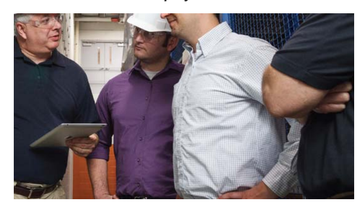
STEP 10: Train Your Employees

Employee training is an essential element of establishing an effective slip, trip and fall prevention program because these are the people that are on the floor each day. They need to be in on it and know why slips, trips and falls occur, how they can be avoided and how to respond when one occurs.