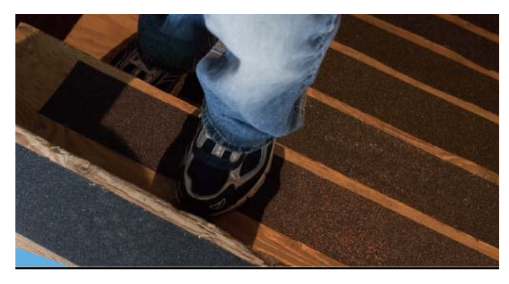
STEP 4: Improve Stair Safety